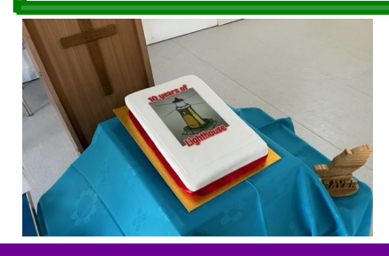
Lighthouse group's 1oth birthday cake

Contact Ivy for more details – you are most welcome.